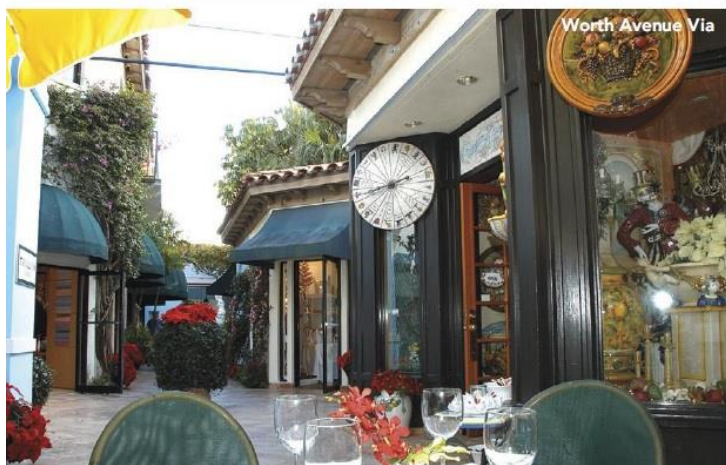
Worth Avenue Via

◆ The Royal Poinciana Plaza, a beautiful landmark venue freshly revitalized, features inviting outdoor spaces with fountains. New stores expected to open in November and December include Hermés, Cynthia Rowley, Magasin, Orlebar Brown and others. Dining venues include Sant Ambroeus. 340 Royal Poinciana Way, Palm Beach, theroyalpoinciana.com