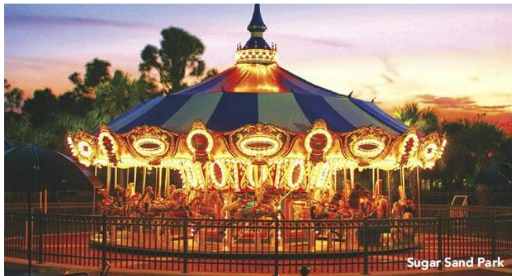
Sugar Sand Park