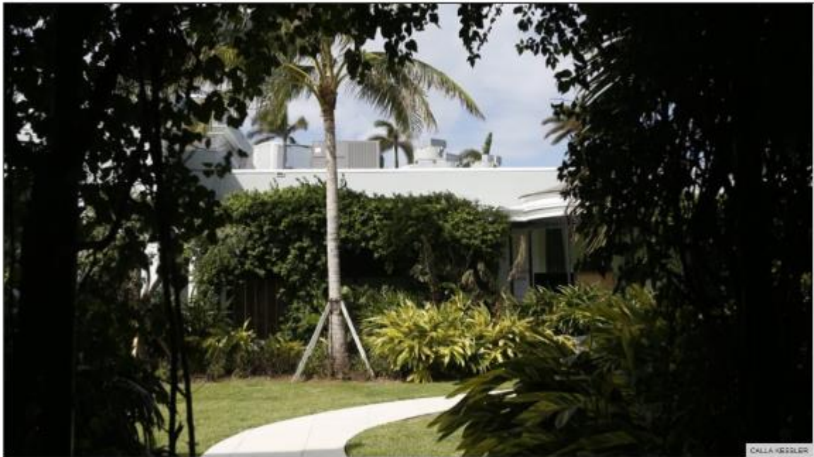
The Royal Poinciana Plaza is undergoing construction and renovations to the shops and businesses in the strip on Wednesday, Oct. 11, 2017, in Palm Beach in Florida.

Posted: 2:00 p.m. Monday, October 16, 2017