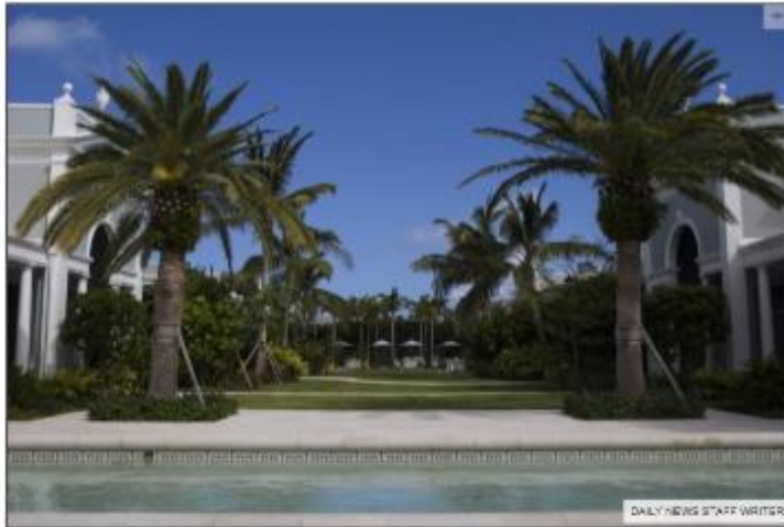
A ribbon-cutting for the plaza is set for Nov. 29 followed by a Jan. 20th grand-opening celebration. Read More

Bradley Park renovations are underway, bridge construction is finished — creating a smooth two-lane entrance into the town — and the plaza will have its grand opening to showcase its now 50 businesses in what could be another booming home for shopping on the island along with Worth Avenue and other corridors.