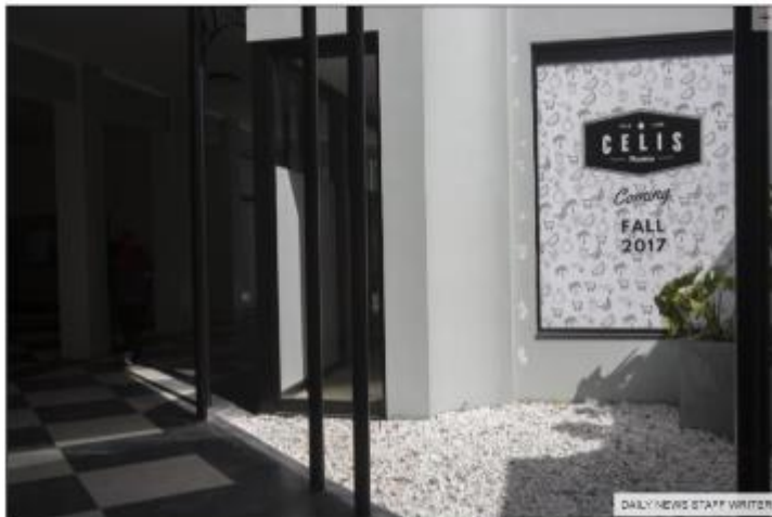
A sign announces the upcoming arrival of Celis to the Royal Poinciana Plaza.

The plaza — or just The Royal , as some have taken to calling it — announced a dozen incoming businesses in August, including Celis Produce and Virginia Philip Wine, Spirits & Academy .