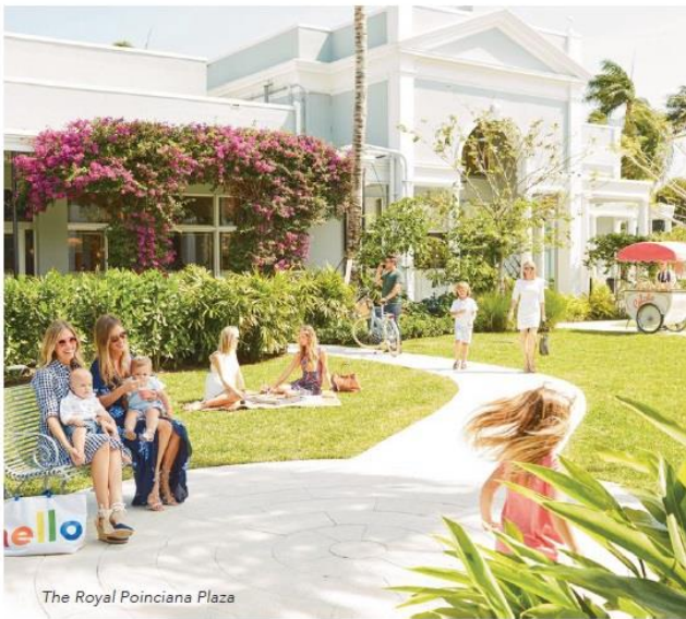
The Royal Poinciana Plaza