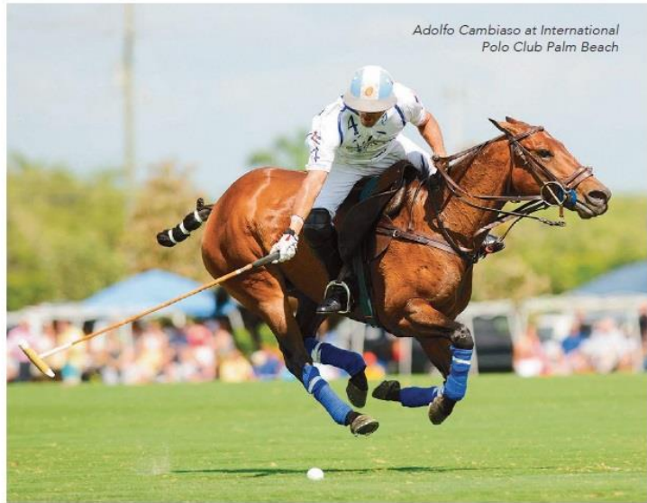
Adolfo Cambiasso at International Polo Club Palm Beach

Polo is back! From Dec. 31 through April 22, you can watch the world's finest two- and four-legged athletes in action at the International Polo Club Palm Beach, one of the premier polo destinations in the world. Attend a low-key match on the backfields during the week, or make a social afternoon of it during Sunday's featured stadium games, where you can enjoy polo, brunch and cocktails with some of Palm Beach's finest. 3667 120th Ave. S., Wellington; 561.204.5687; internationalpoloclub.com