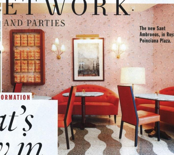
The new Sant Ambroeus, in Royal Poinciana Plaza.