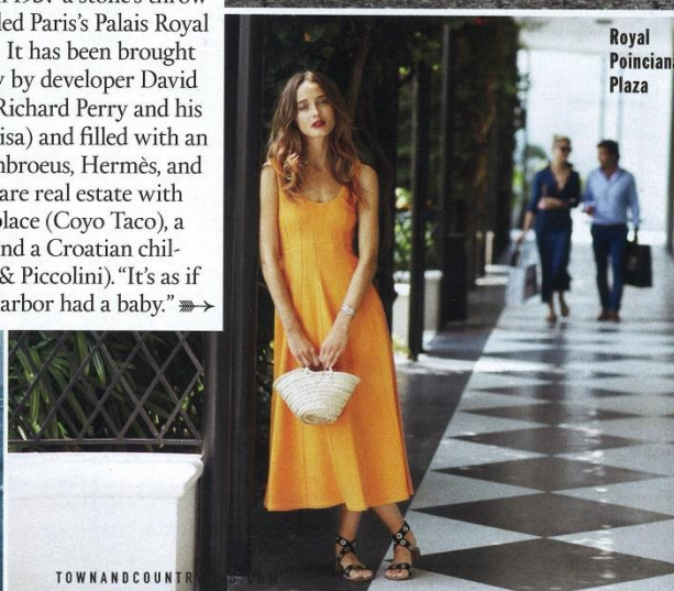
Royal Poinciana Plaza