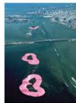
THE COLONY PHOTO © 2014 ILM/JARREN; ROYAL POINCIANA PLAZA PHOTO BY BESS/STUDIO LLC; HOTEL SOUTH BEACH PHOTO BY ERIC LAUREL; DOCUMENTARY PHOTOGRAPHY OF SURROUNDED ISLANDS BY GUY ARONE; GREATER MIAMI, FLORIDA, 1980-83; PHOTO BY WOLFGANG VOLZ © CHRISTO 1983

Fall's must-go exhibition is about looking back. Surrounded Islands ( pamm.org ) on display from Oct. 5 to Feb. 17 commemorates the 35th anniversary of Christo and Jeanne-Claude's 1983 installation in which they encircled 11 Biscayne Bay islands with pink fabric.