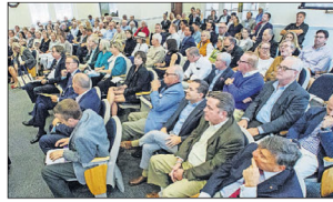
A large crowd attends a discussion surrounding the proposed private club Carriage House at the Town Council meeting on Wednesday.