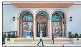
Front facade of the King Library as seen on Dec. 7. This morning, the Four Arts will host a ribbon-cutting and a public celebration at noon.