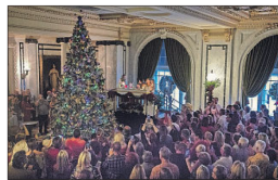
A large crowd packs the Grand Hall of the Flagler Museum to see members of the Flagler family light the Christmas Tree in 2017. The museum's Christmas tree lighting festivities will begin at 3 p.m. today.

Holiday activities: Carlo DeVito will speak on "Dickens and Twain: The Yuletide Writings and Traditions of the World's Greatest Writers" at 2 p.m. today at The Flagler Museum, One Whitehall Way. The museum's Christmas tree lighting festivities will begin after that at 5 p.m. Call 655-2833 for more information.