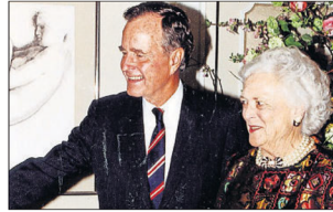
George and Barbara Bush shake hands at Club Colette in March 1994. The former president died late Friday at 94 at his home in Houston.