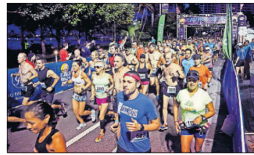
Runners start the Palm Beach Marathon along Flagler Drive in downtown West Palm Beach in 2015.

Earlier this year, the Town Council denied a request to have the marathon be run partially along the Lake Trail. Last year, about 3,500 runners crossed the Flagler Memorial Bridge, ran down the Lake Trail and exited at the Royal Park Bridge.